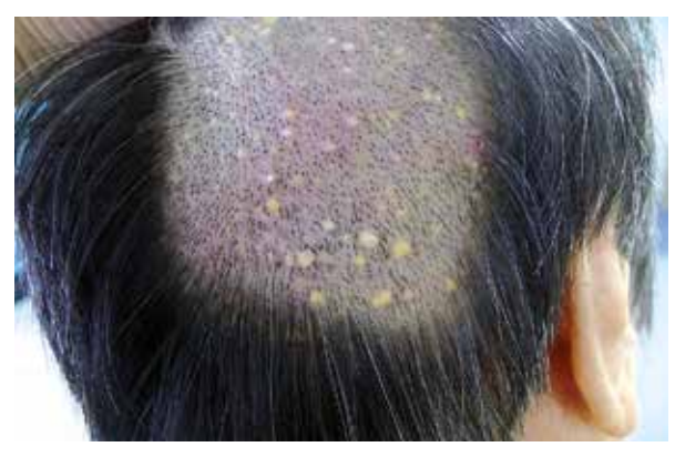
Figure 1. Multiple white and yellow cystic nodules scattered on the scalp

It is reported that early-onset steatocystoma multiplex is mostly caused by a mutation in KRT17 [3]. Steatocystoma multiplex most often occurs on the chest, neck, axillae and proximal extremities where the pilosebaceous apparatus is well developed, but it rarely occurs on the scalp. Steatocystoma multiplex limited to the scalp was first described by Marley et al. in 1981 [4]. Since then, there have been several similar reports of its occurrence on the scalp. Our case is unique due to the late age of onset and the characteristics of multiple lesions. In contrast to the typical steatocystoma multiplex, cases limited to the scalp are usually nonhereditary and do not develop until later in life, as in our case. It has been reported that steatocystoma multiplex may be associated with other abnormalities, such as pachyonychia congenital, congenital alopecia, hypohidrosis, hypothyroidism and acrokeratosis verruciformis of Hopf [5]. However, in our case, there were no associated accompanying symptoms. The clinical differential diagnosis of steatocystoma multiplex